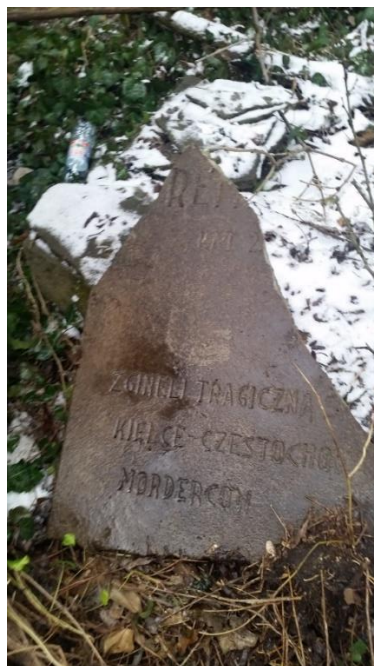
Fragment of the gravestone in the Częstochowa cemetery